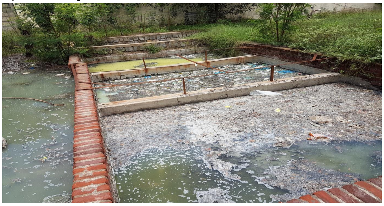
Sewage Treatment Plant of Capacity 50KLD