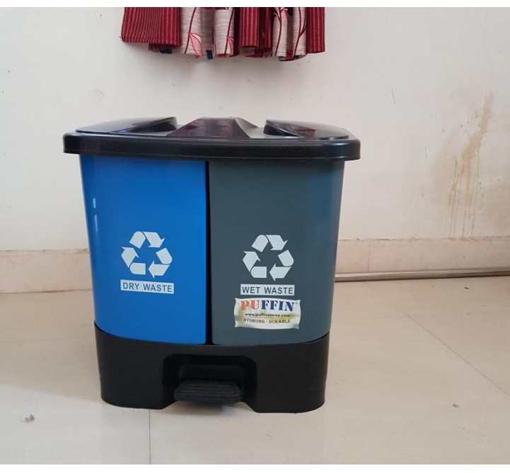
Separate bins for collecting Inorganic & organic dry waste (blue) and Organic wet waste (grey)