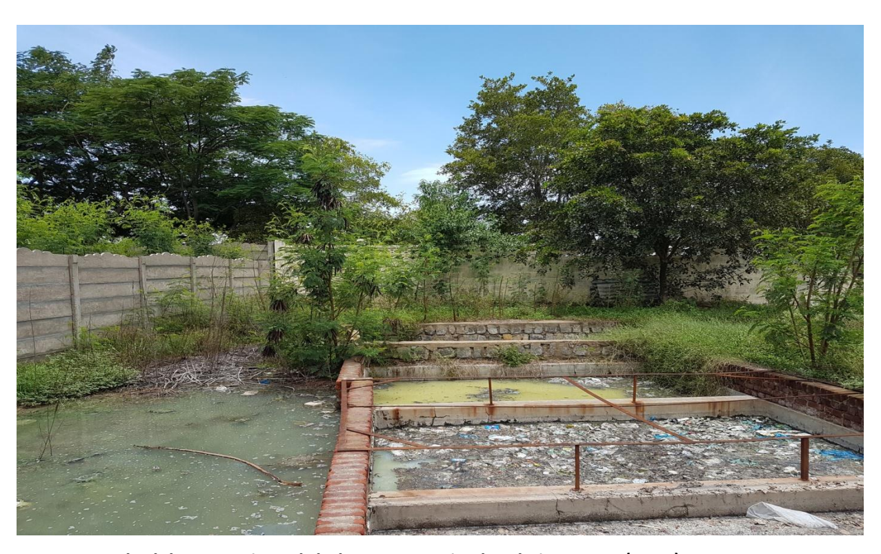
Process methodology – Activated sludge Process; Fixed Bed Bio reactor (FBBR)