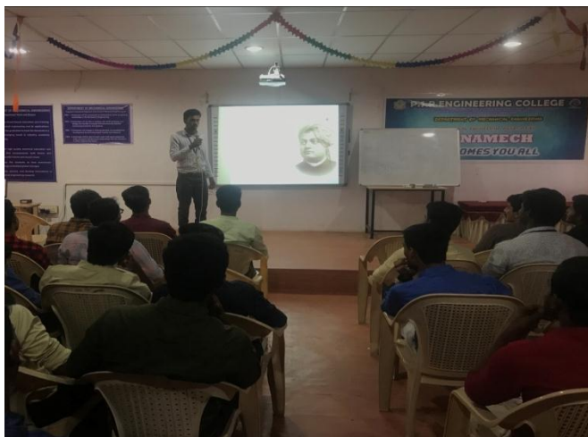
On national youth day conducted speech competition. Finally, gifts are distributed to students who give the best.