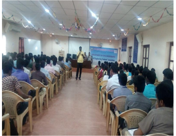
The guest lecture delivers the lecture to the students on engineers' day